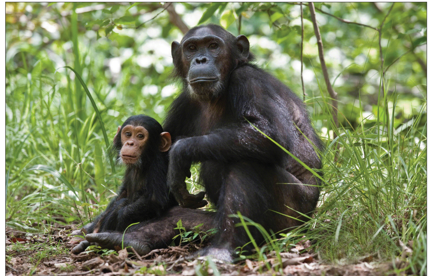
Left: Dr. Jane Goodall beside a waterfall in Gombe National Park, Tanzania. Above: Gaia and her son Google in Gombe National Park, Tanzania.

years have shown only slight variation to the questions Jane gets asked.