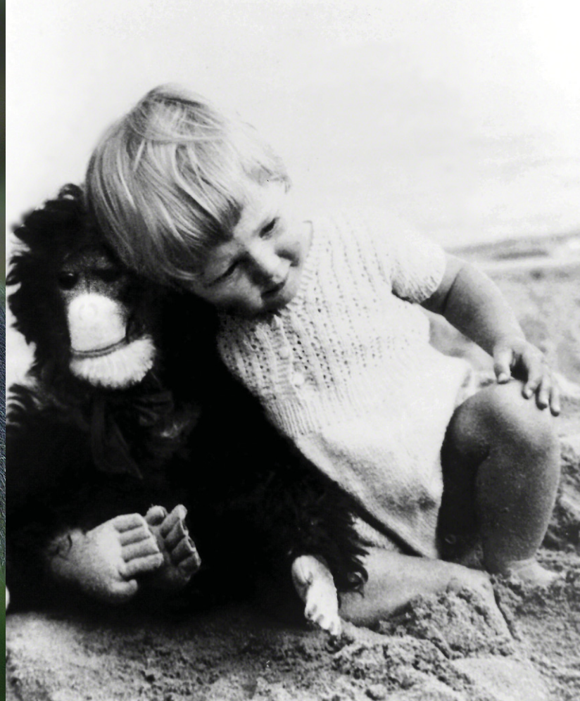
Opposite: Dr. Jane Goodall, DBE, U.N. Messenger of Peace.

provide valuable insight into the behaviors of early humans. It wasn't long before he realized that his new secretary was a perfect fit for the monumental task.