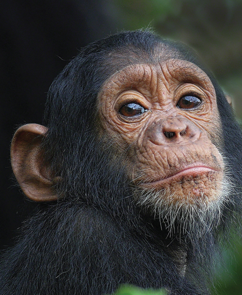
Above: Infant in Gombe National Park, Tanzania.