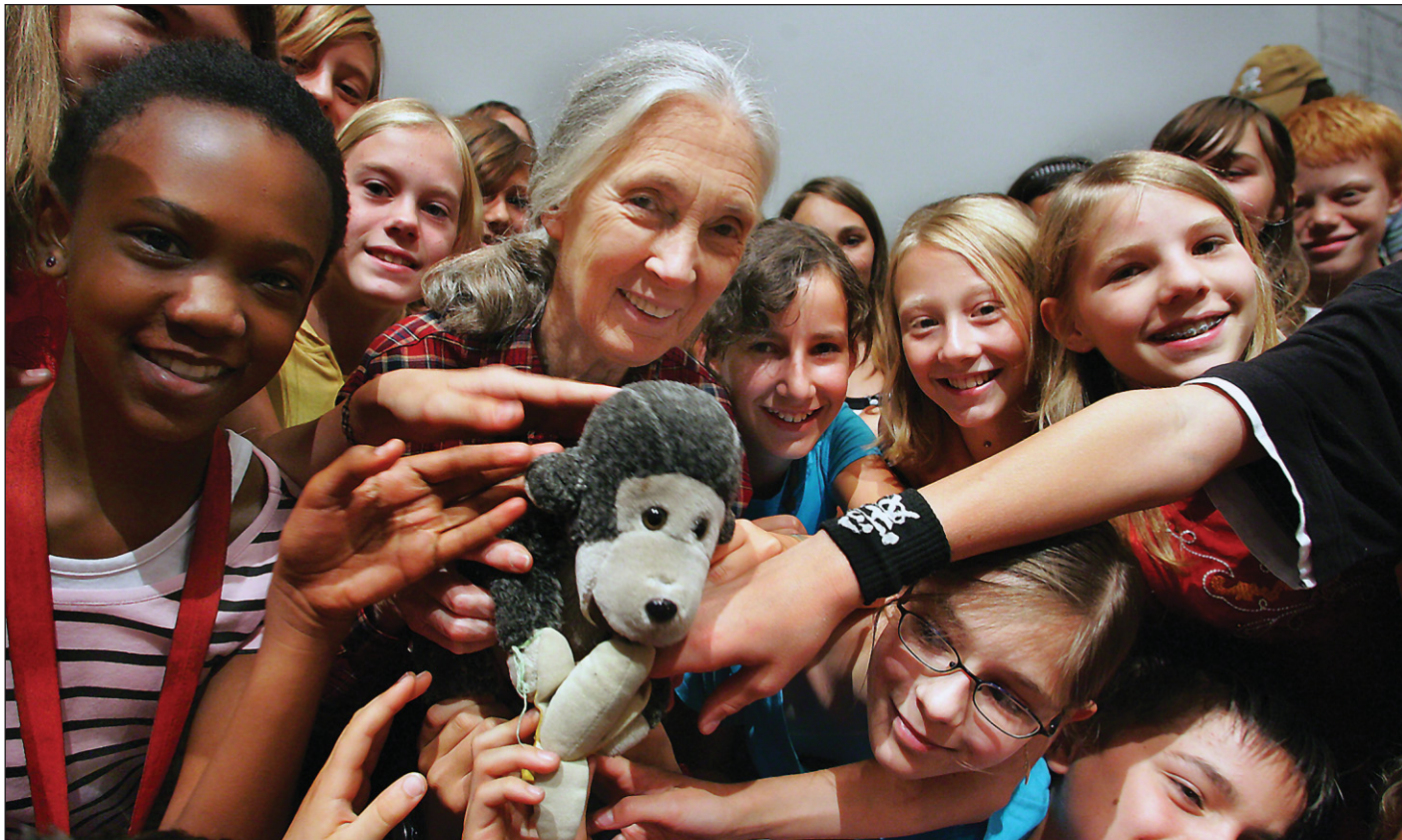
Above: Dr. Jane Goodall with a group of Roots & Shoots members in Salzburg, Austria. Opposite: Gremlin carries her son Grendel in Gombe National Park, Tanzania.

to shift people towards this new mindset and away from “business as usual.”