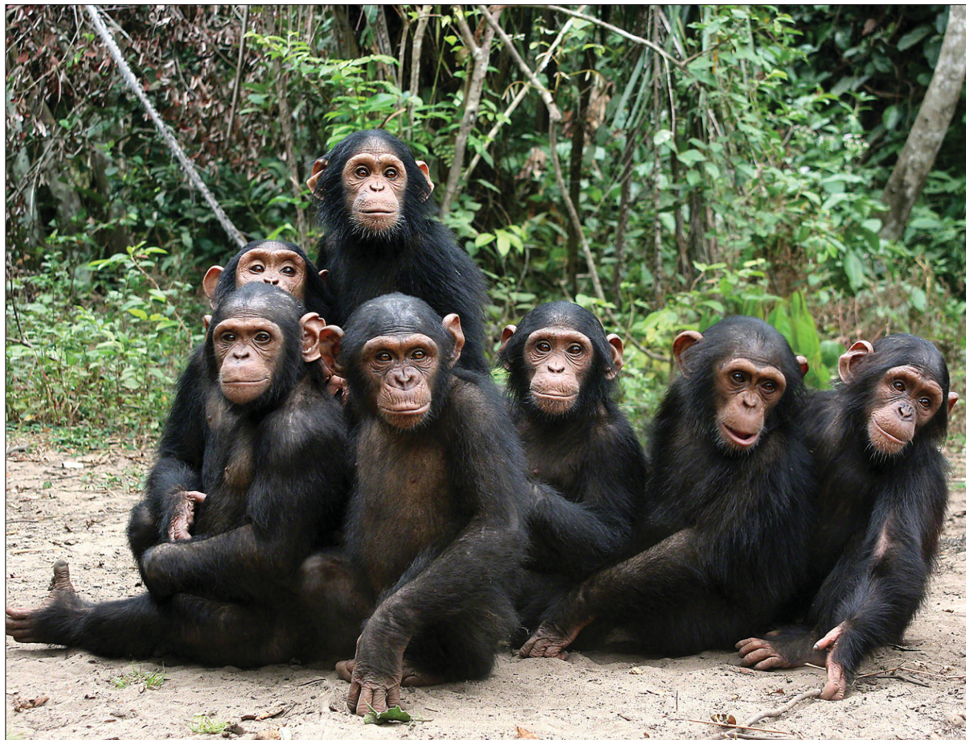
Above: Orphan chimps at the JGI Tchimpounga Chimpanzee Rehabilitation Center in the Republic of the Congo.