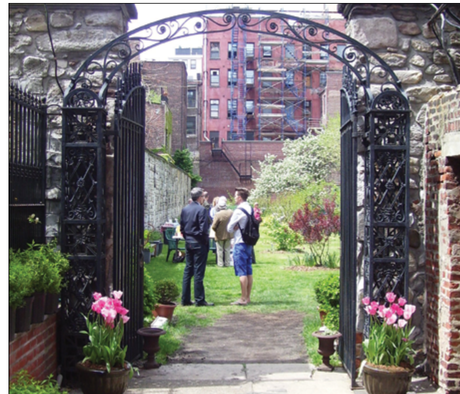
Above: The Cemetery is accessible through two pairs of handsome iron gates on either end of a 100-foot-long alley.

numbers. The popularity of the NYMC was so great that entrepreneur Perkins Nichols immediately built another cemetery a block away, the New York City Marble Cemetery ( nycmc.org ) across Second Avenue, with its gate on Second Street. Although identical below ground, the two cemeteries look quite different to passersby and have always been independent of each other. That cemetery can be easily seen from the street and has many large funerary monuments on the lawn. The similarity of the names and addresses has caused endless confusion from 1831 to the present day.