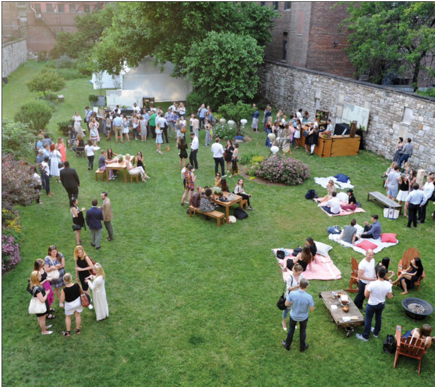
Above: Guests at a summer soiree sponsored by Dreaming Tree Wines (owned by rock star Dave Matthews) enjoy a wine tasting and food products launch in 2016. Rentals of the secret garden help pay for restoration of the grounds and walls.

constantly being gathered, as are reproductions of portraits of the early owners, 19th-century merchant advertisements, and images of the ships owned by the founders. Through the stories of those interred in its vaults, the Cemetery in effect serves as a repository for information providing insight into an important transformative period in New York and